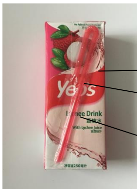
Illustration of Components

Overall weight may differ due to rounding.